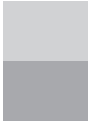
1/2 page 260mm x 180mm Horizontal

Total Column cm - 144cm Price - $1135.00 Plus GST